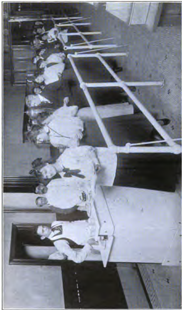
In Allegheny High School in Pittsburgh 400 pupils are served in about six minutes